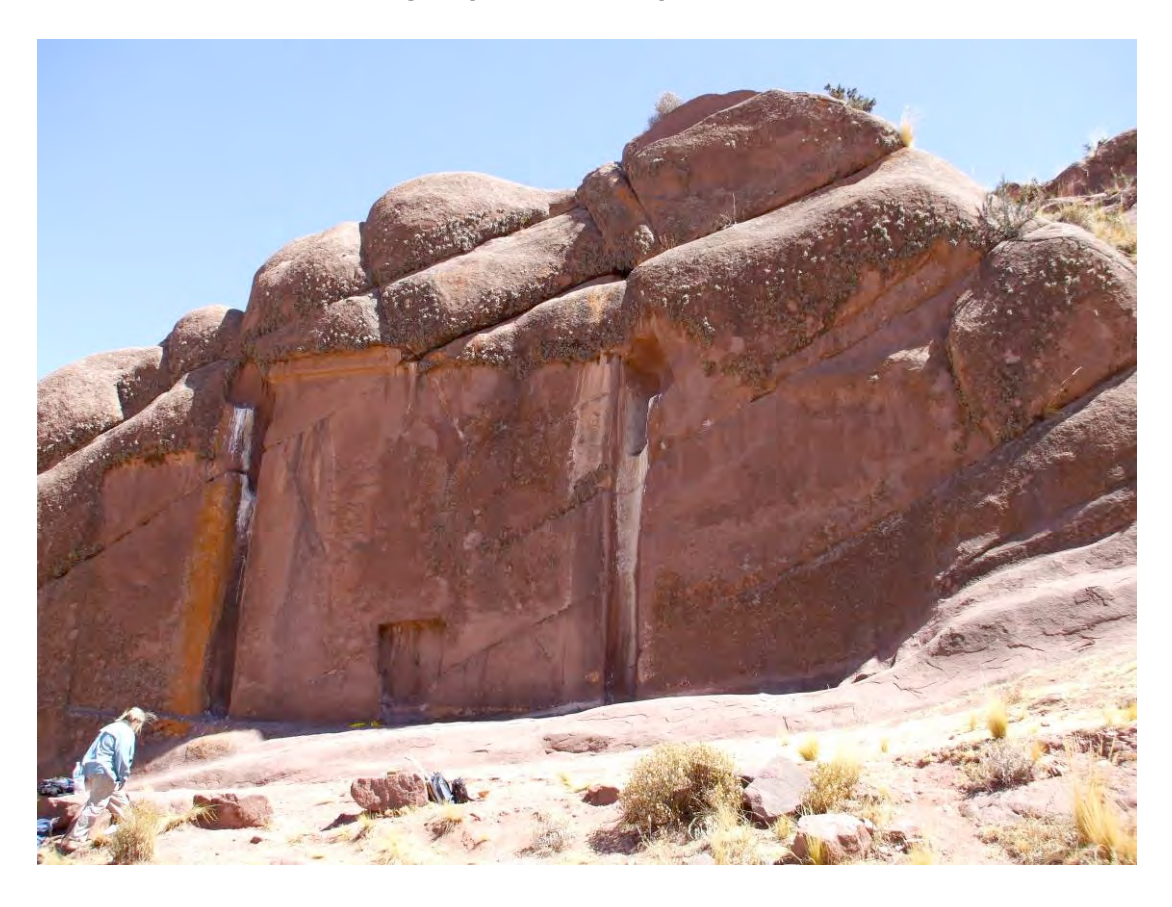
The Aramu Muru Gateway, Peru