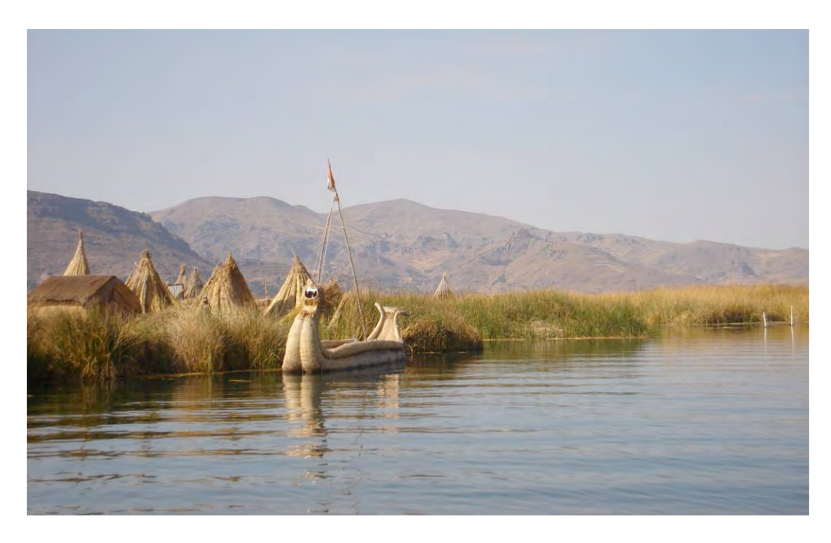
Uros Islands, lake Titicaca, Peru We spend quite a bit of time at Lake Titicaca in Bolivia. This region is one of rare power and incredible beauty. There are islands in this region that hold the secrets of the ages. Our guides and Shamans work with us to help unlock these secrets make our visit an unforgettable experience.