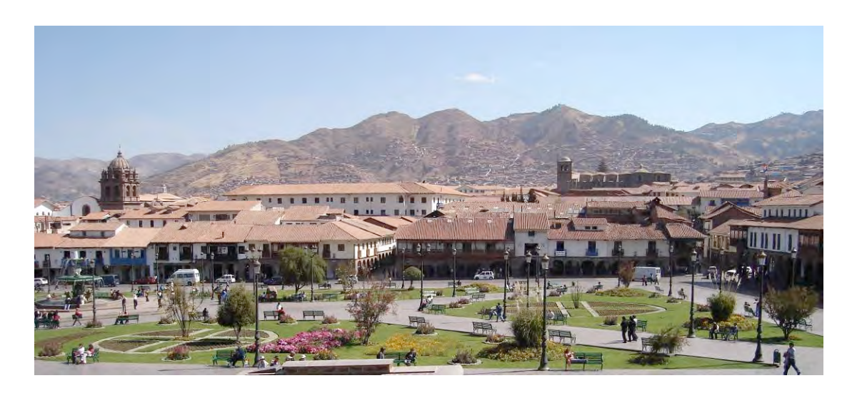
Plaza De Armas, Cusco, Peru