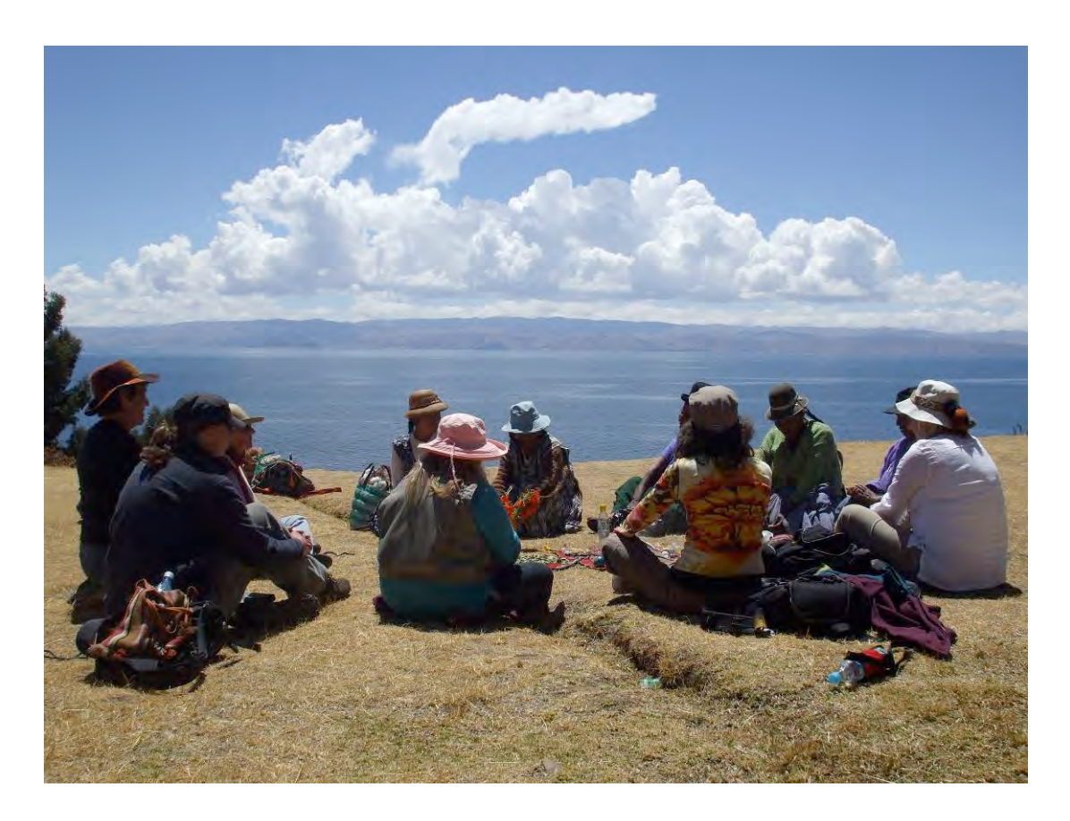
Ceremony - Island of the moon, Lake Titicaca, Bolivia

The group is kept to 10 or 12 people I keep the group size small to ensure a more intimate experience and find that we are often able to go to places inaccessible to larger groups